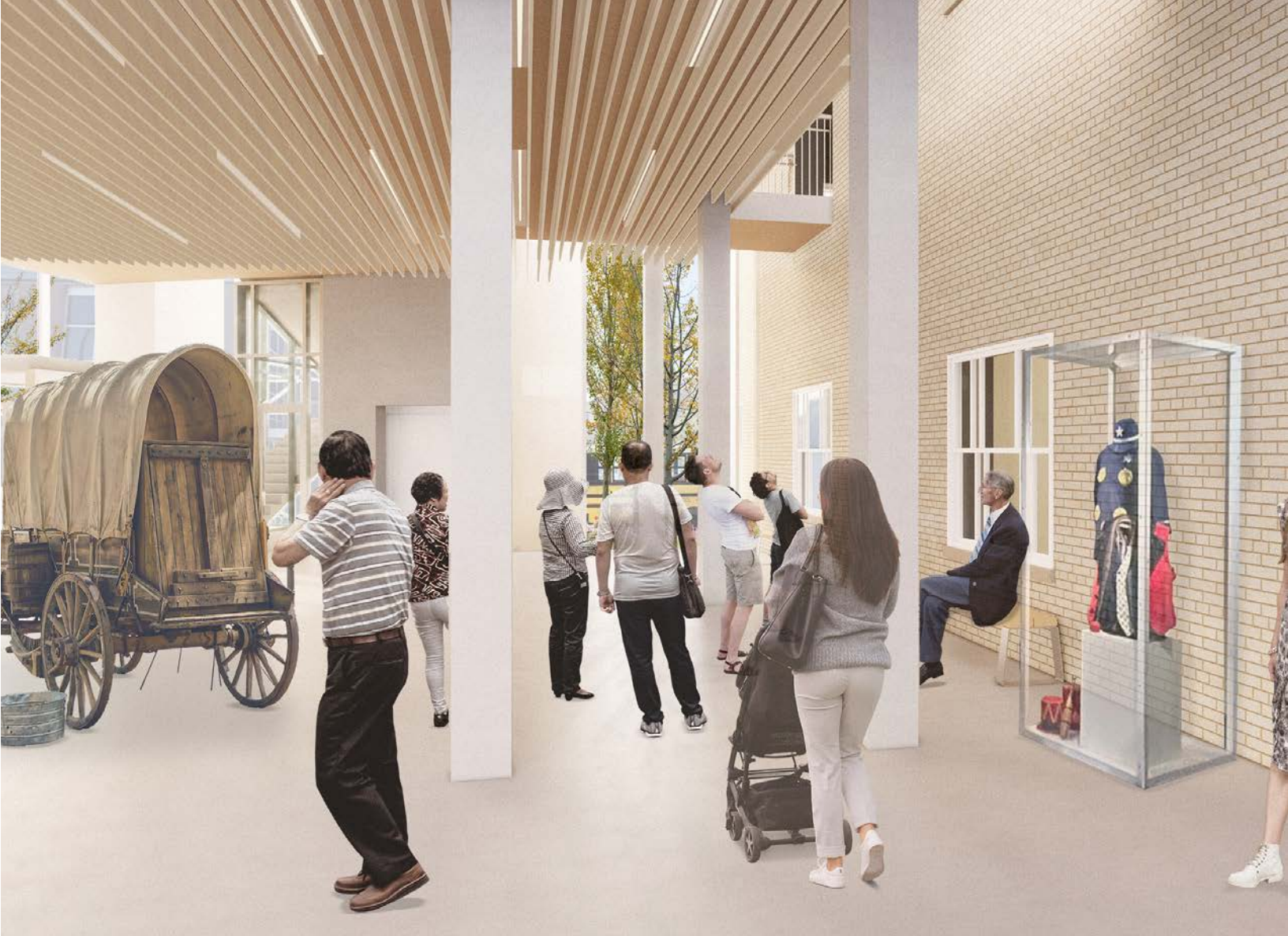
Building renovations will preserve functionality and historical value.

“Our museum is a place of discovery, imagination, and fun! This is where transformation occurs!”