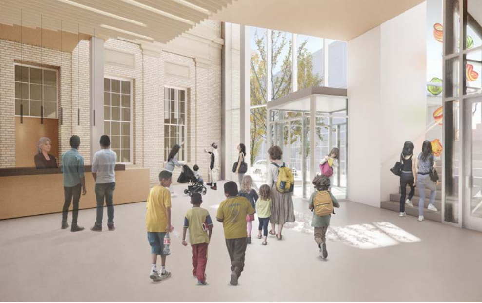
Accessible exhibits for all.

“The greenest building is one that already exists.”