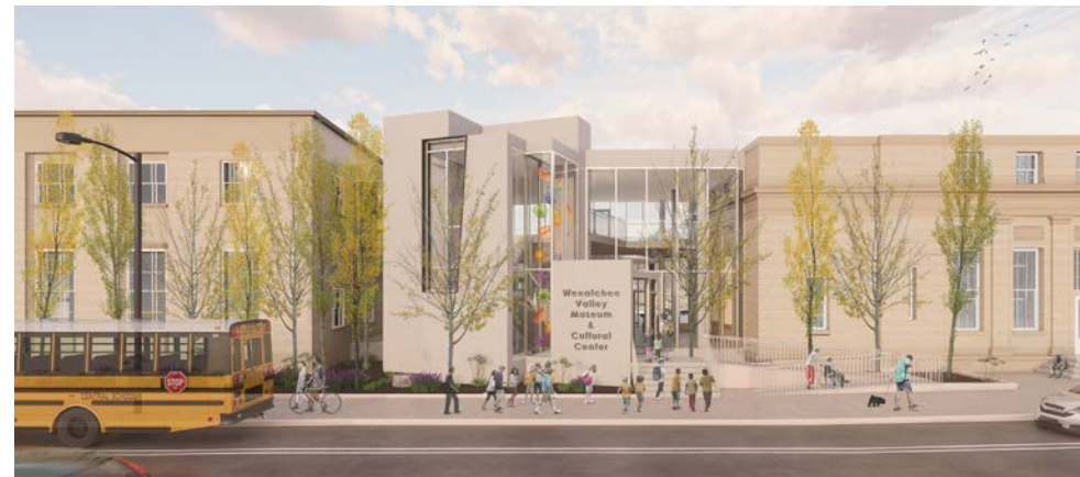
From left to right: Current front entrance off Mission street, rendering of new Mission street entrance.