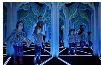
Immersive and hands-on exhibits like these from Luci Creative will invite participation and spark curiosity.

It's time to grow the Museum into a more interactive and immersive destination.