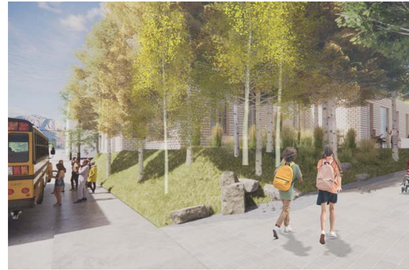
Accessible entrance for wheelchairs and strollers.

Through this campaign, the Museum will emerge as a North Central Washington community anchor—one that sits at the confluence of past and future and inspires curiosity and engagement.