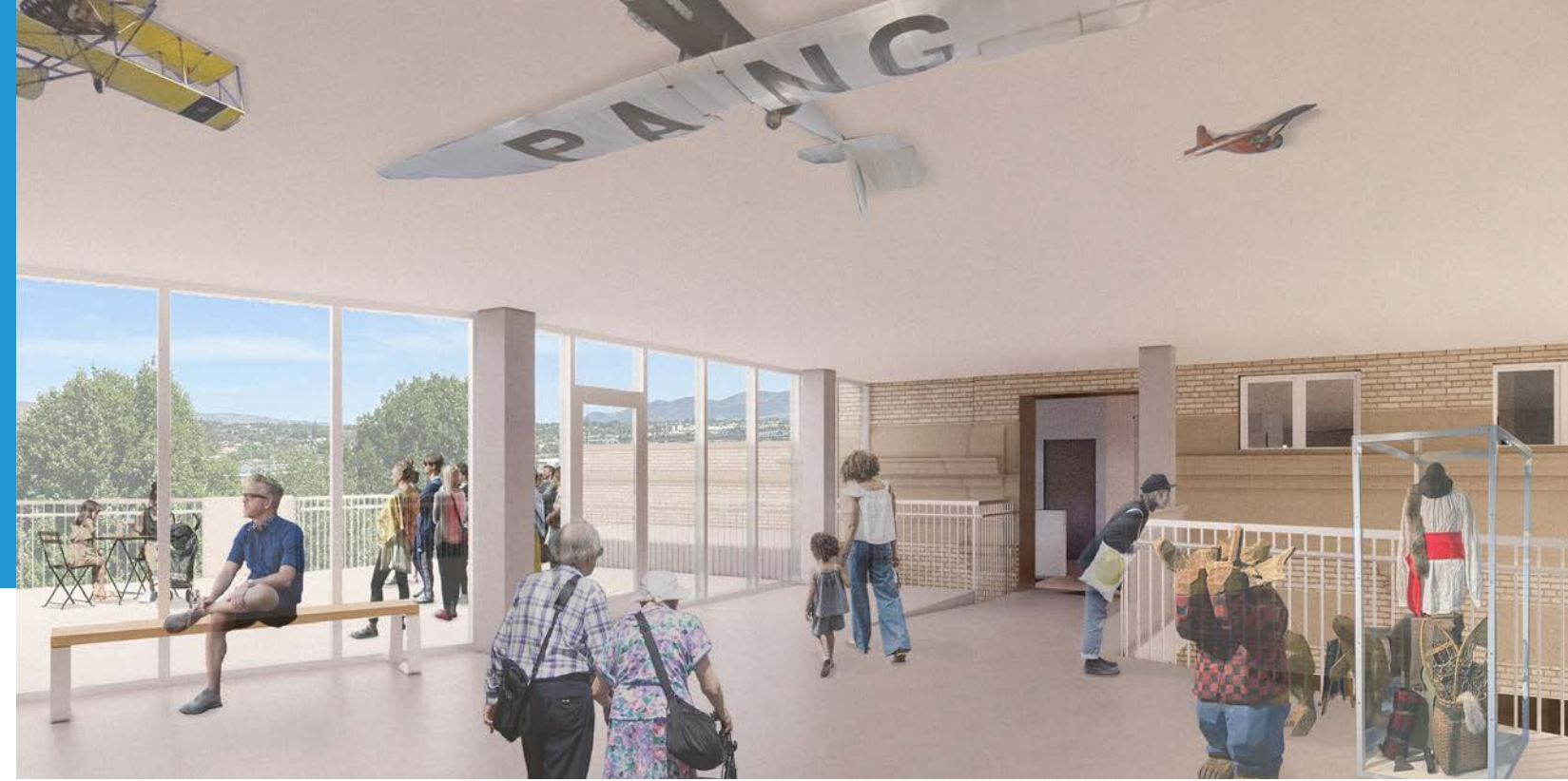
Large, sunlight-filled space connects buildings and adds exhibit space.