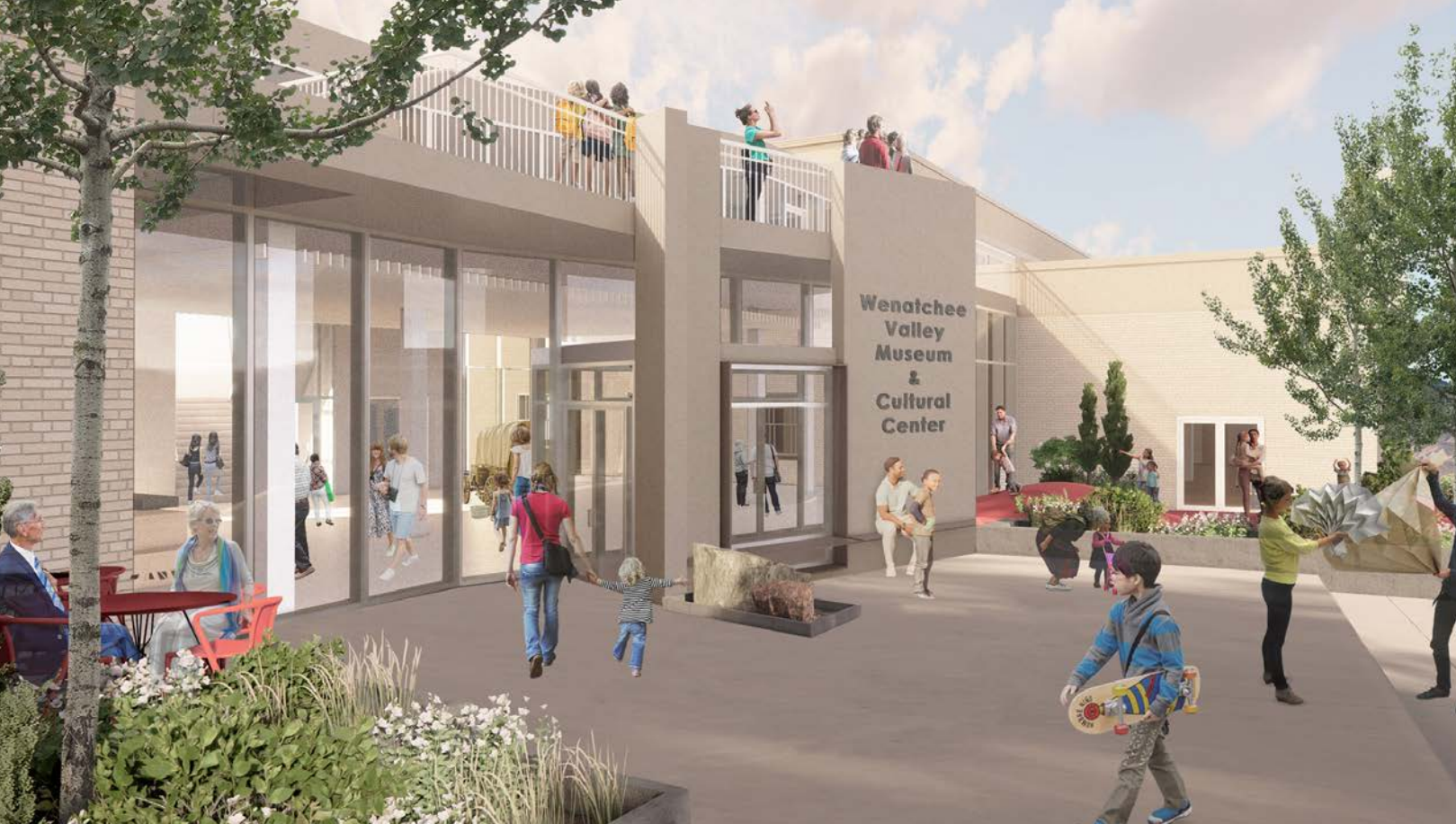
A place for all ages to learn and grow.