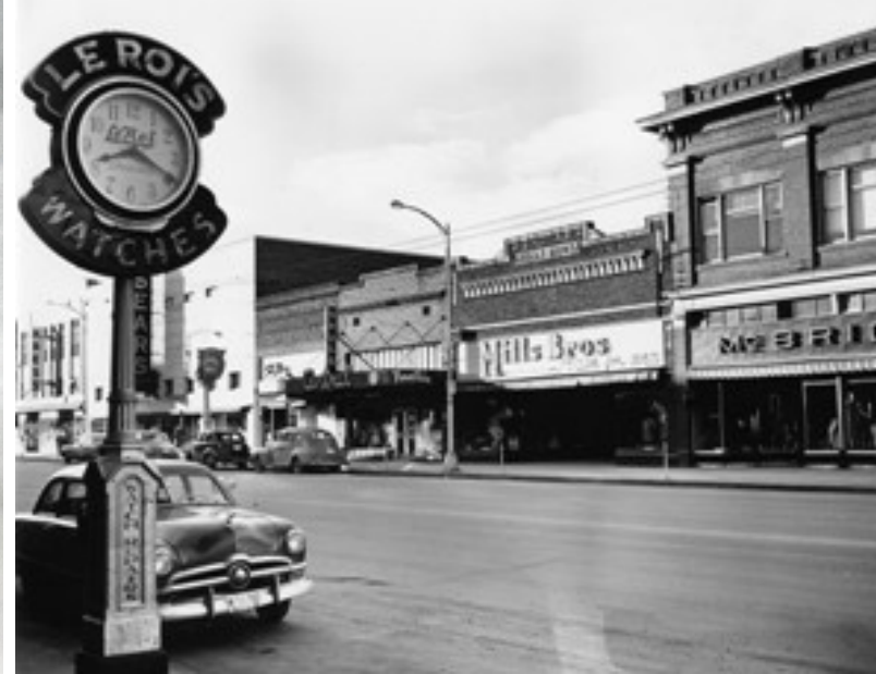
From left to right: Historic welcome sign. Wenatchee Avenue.