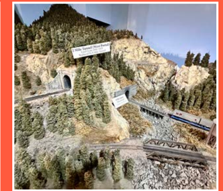
From left to right: Apple sorting machine. Summer camp outing. Great Northern Railway Diorama.